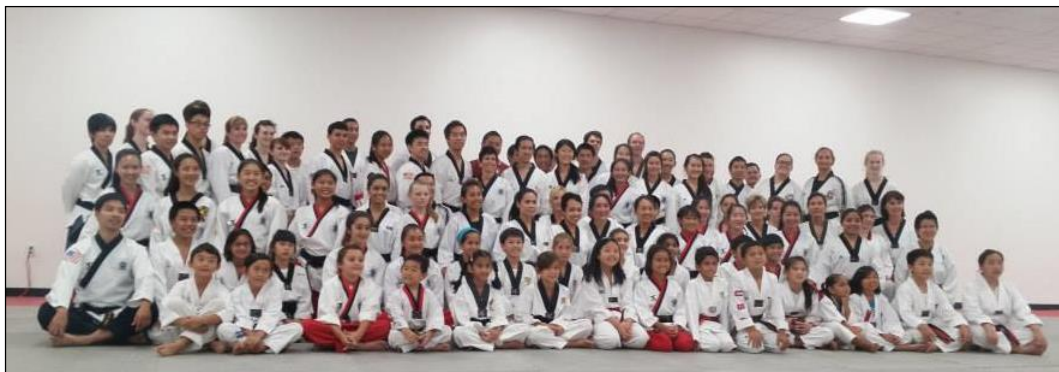
National Team Fundraising Camp #2 in Palo Alto, CA at Stanford University

to the team was collected on-site, and $84 of merchandise donated and sold by the team-M to the national team was also collected for a net of $6,268.81 raised for the team.