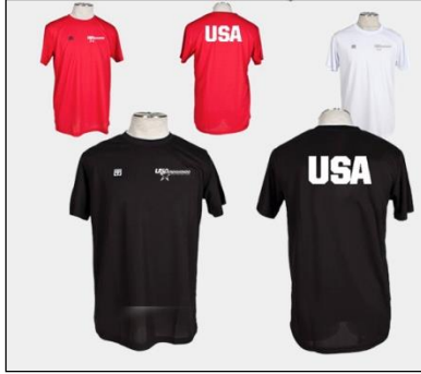
Mooto USA supplied team shirts as well as additional competition uniforms