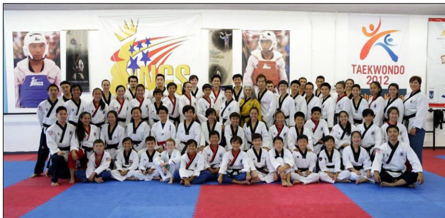
National Team Training Camp Fundraiser #1 in Chatsworth, CA at King's Taekwondo